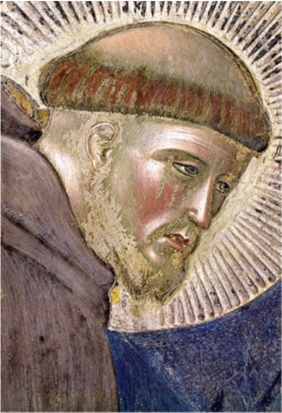
Francis of Assisi

Just as the breach was opened by a Francis, so will the breach be closed by a Francis. But why a Jesuit as Pontiff? In the Catholic Church, Jesuits are the equivalent of the Melchizedek Order in the Local Universe. Jesuits are the teachers and emergency workers entrusted with teaching and defending the faith. He is the right man for the job.