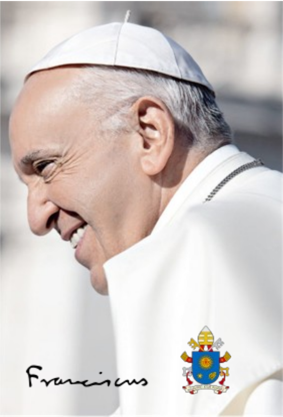
Pope Francis - FRANCISCUS